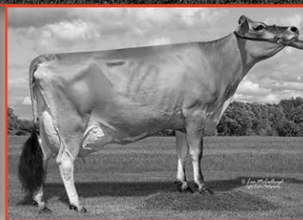
TJF/Lee Action Mamme 847-ET, E-91% 4-4 305 3x 18,530 6.0% 1,100 3.7% 685 Owned by Heartland Jerseys, KS